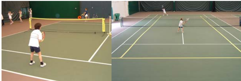
U8 = 1/2 Court Tennis

The International Tennis Federation (ITF) is fully endorsing Progressive Tennis as part of their world-wide "Play & Stay" tennis initiative. (See: www.tennisplayandstay.com )